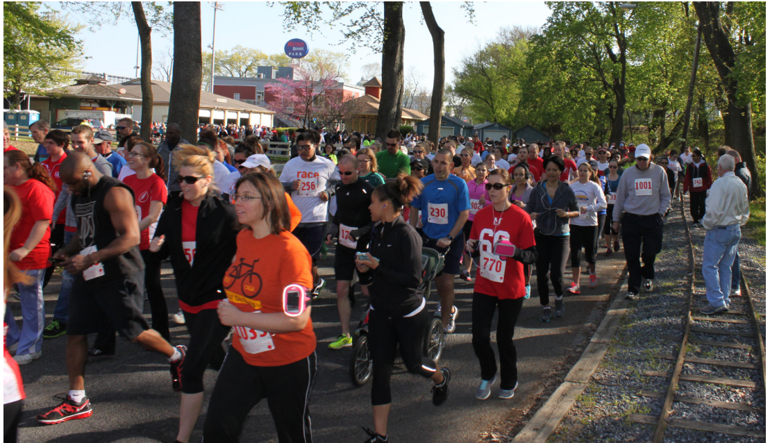
Runners and walkers head out from the starting line on City Island.