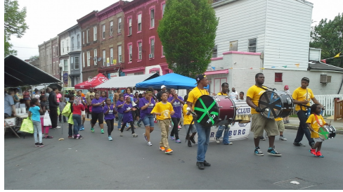
Drummers from the Harrisburg Boys & Girls Club lead off the parade during the 12th Annual South Allison Hill Multicultural Festival.

The YWCA partnered with a coalition of community agencies for the 12th Annual South Allison Hill Multicultural Festival on May 10. This signature event built neighborhood pride and a sense of community, while celebrating the cultural diversity of the neighborhood and strengthening connections