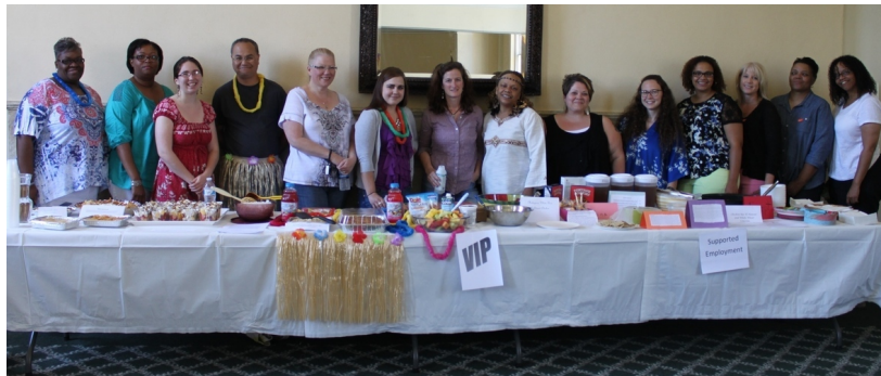
Staff members pose with a variety of dishes they made for a potluck lunch held June 20 to celebrate Asian-American and Arab-American Heritage Months.