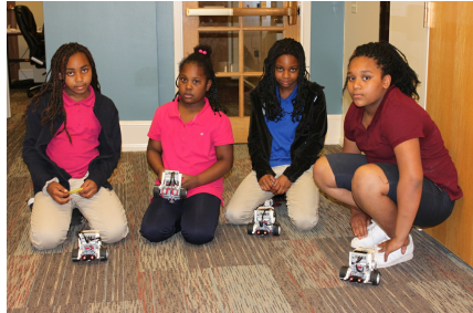
Girls involved in the YWCA's TechGYRLS program show off the LEGO robots that they constructed. TechGYRLS is designed to nurture STEM (science, technology, engineering, math) areas for girls ages 8-12.