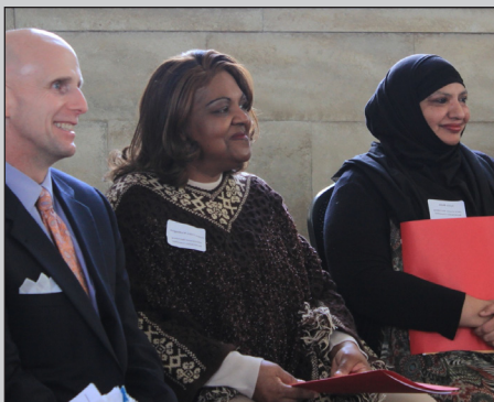
A diverse group of civic and business leaders participated in the six-week pilot program “Let’s Talk: A Conversation About Race.”