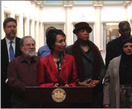
State Rep. Patty Kim, center, advocates for passage of House Resolution 718, which condemns racial profiling.

This year, the YWCA initiated mandatory racial justice training as well as optional educational opportunities for staff. All YWCA employees are required to complete a two-hour Racial Justice Training, which will reach 100% completion by the end of 2014.