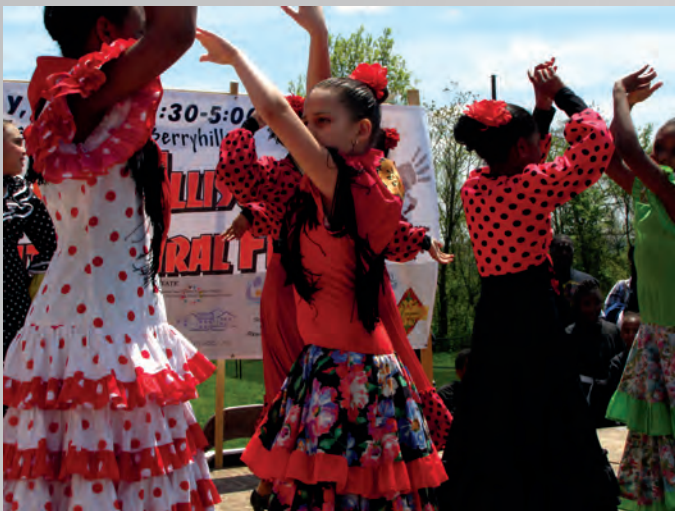
Dancers at the South Allison Hill Multi-Cultural Festival

1,621 victims of domestic violence, stalking, dating violence and sexual assault, in 1,893 cases.