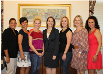
Participants of the YWCA Ambassadors Training Program gathered for their final training on Aug. 14. Graduates are equipped to serve as spokeswomen in the community for the YWCA and its programs.