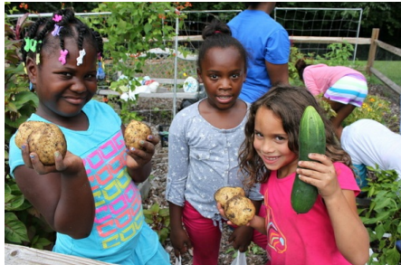
Junior Gardeners harvested potatoes, cucumbers, carrots and other produce from their vegetable garden located on the grounds of the John Crain Kunkel Center.