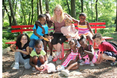
Children from the YWCA's Grace M. Pollock Child Development Center took a field trip on Aug. 2 to the Five Senses Gardens, located in the Capital Area Greenbelt.