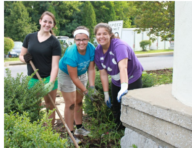
About 20 members of the Central Dauphin Ram Band helped spruce up the grounds of the John Crain Kunkel Center on Aug. 9 as part of the band's service day.