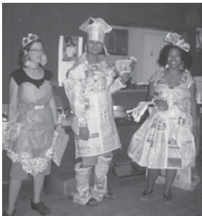
Three of the YWCA's fashion show models strike a pose.

The festivities kicked off around noon, and once everyone had eaten their fill, the games began. A "who's pet?" game was popular (no, Pamela you don't really look like Baxter!).