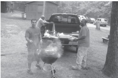
The staff grilled enough hot dogs and hamburgers to feed an army!

Staff enjoyed the beautiful late summer afternoon at Camp Reily, the site of the YWCA of Greater Harrisburg's summer camp for inner city children. Delicious pastas, sides and desserts filled the tables, and the smell of juicy hamburgers and fire licked hot dogs filled the lodge.