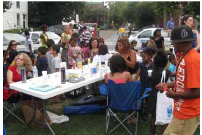
(Free food, games and crafts were offered to community residents.)