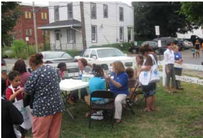
(Volunteers donated their time to paint children's faces at The National Night Out event in Allison Hill.)

On a warm Tuesday evening in early August, the South Allison Hill neighborhood joined with millions of people across North America to celebrate National Night Out. National Night Out is designed to strengthen neighborhood spirit and police-community partnerships; and send a message to criminals that neighborhoods are organized and are fighting back.