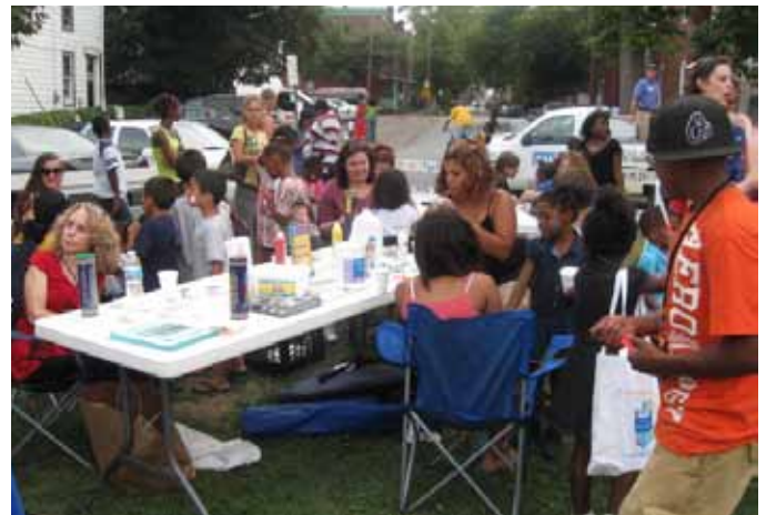
(Free food, games and crafts were offered to community residents.)