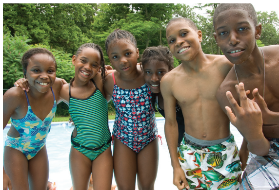
Some of our enthusiastic young campers enjoying the reopened pool and outdoor facilities at Camp Reily.