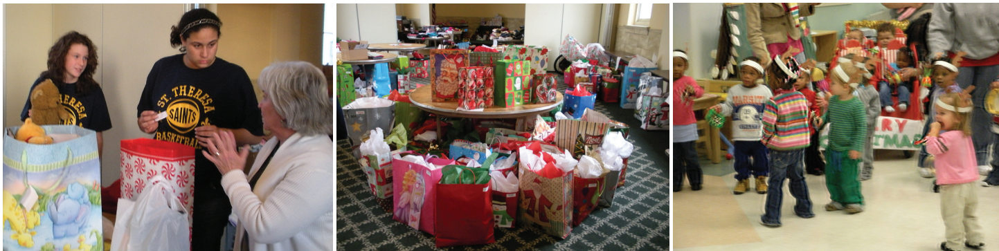
volunteers and happy children all benefitting from the holiday giving experience.

You can make a difference in the lives of women, children and men in our community who are working to get their lives back on track. Join the YWCA Holiday Giving Program today by calling Devan at 717-724-2248.